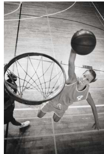
Reach and score with YourBrand™

* Closed User Group (CUG) at additional charge